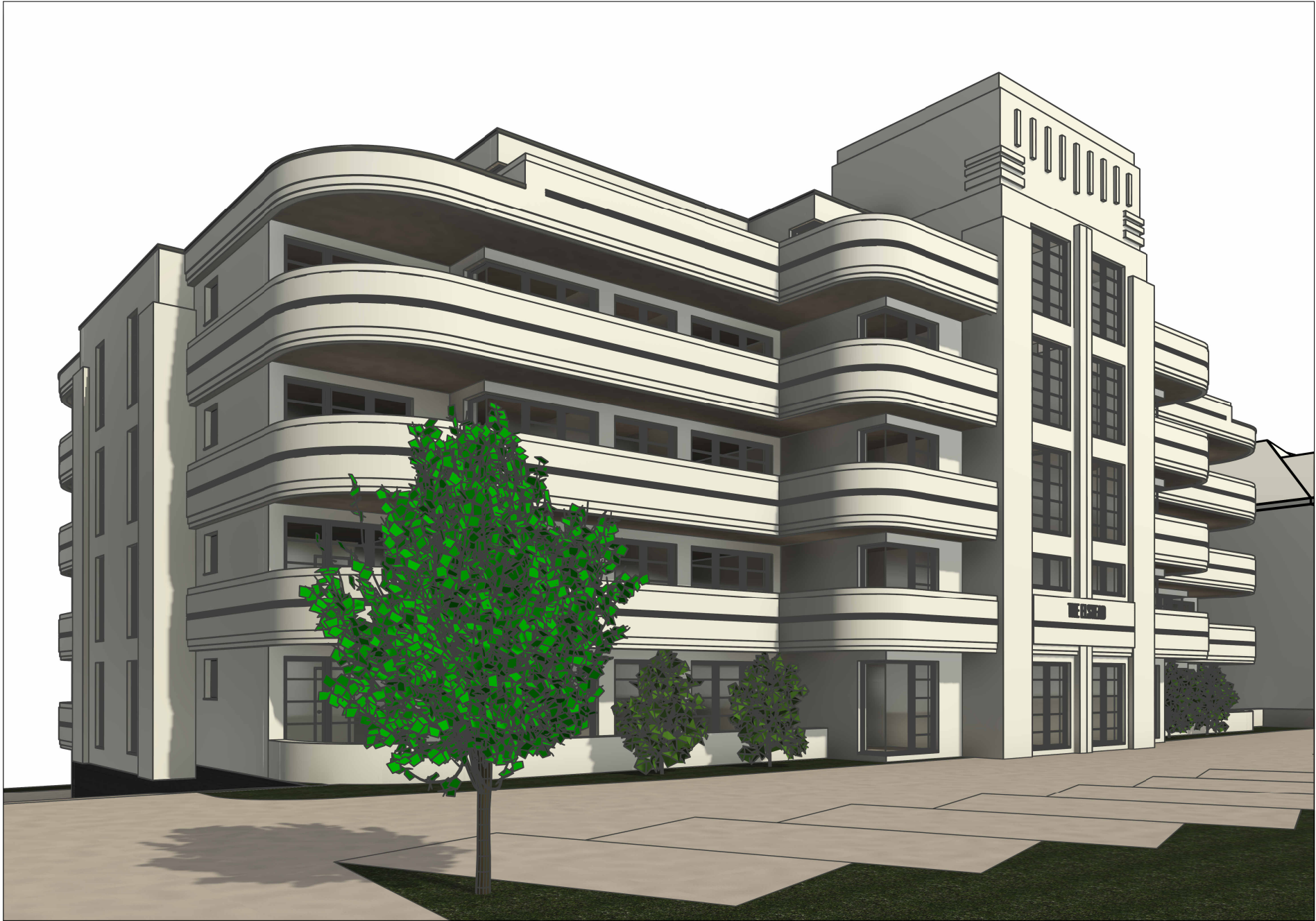
View From Eye Level Contextual 3D View

Drawing Status Key: SK - Sketch P - Preliminary D - Draft S - Submitted A - Approved T - Tender C - Construction IN - Information