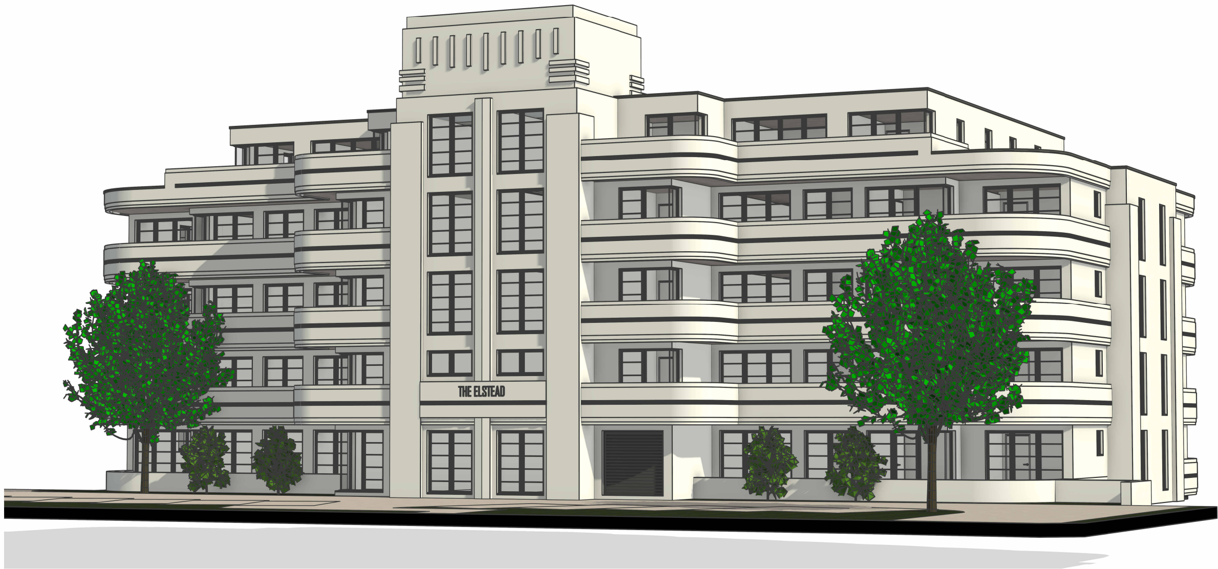
Proposed South Elevation Contextual 3D View